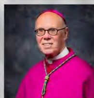
Bishop Gregory Studerus